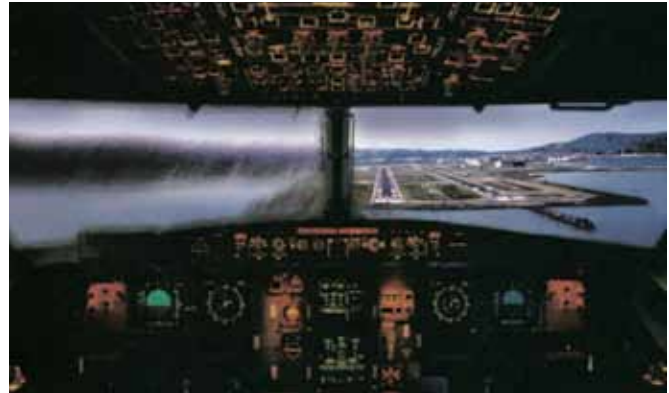
The Difference is Clear – the windshield on the right has been treated with Rain Repellent™ fluid and has near-perfect visibility.

When rainy conditions degrade windshield visibility, the pilot simply flips the Rain Repellent™ switch and the system delivers a calibrated quantity of fluid. In a matter of seconds, visibility is nearly perfect.