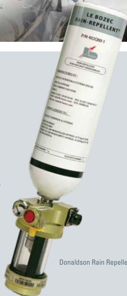
Donaldson Rain Repellent™

Windshield visibility is a serious issue for pilots. Wipers may not be effective in moderate to severe rain. In addition, the field life of windshield coatings is limited, ranging from one week to one year, depending on flight conditions. Donaldson has developed its Rain Repellent™ Fluid and Supply System to improve windshield visibility in even the most adverse weather – whether on the ground, taxiing for take-off or landing.