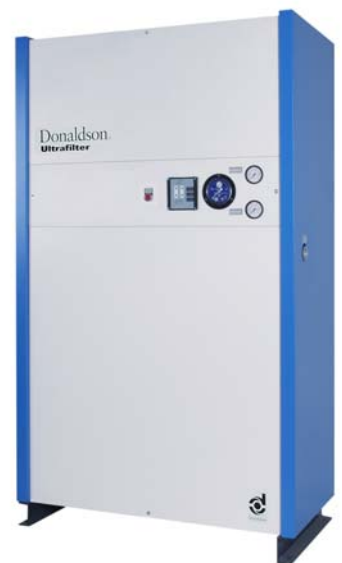
Purification package OFP

In case of an immediate increase in differential pressure, the differential pressure gauge triggers the control and a valve (9) is closed.