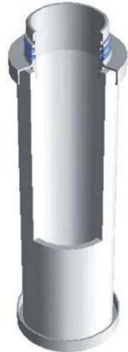
Cross section of the Ultrapoly prefilter

By utilising various filtration mechanisms – such as direct impact and sieve effect – contaminants down to the size of 25 µm particles, are being retained in the filter.