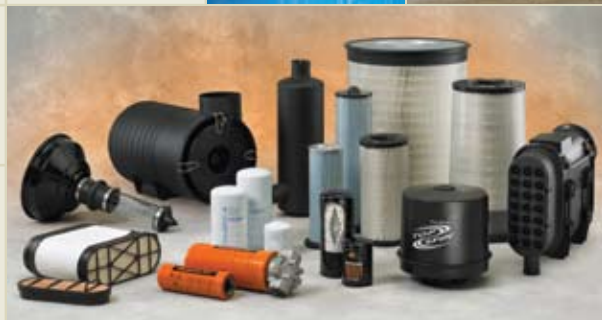
Air Intake Accessories