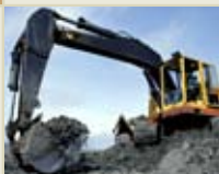
Exhaust Products and Accessories