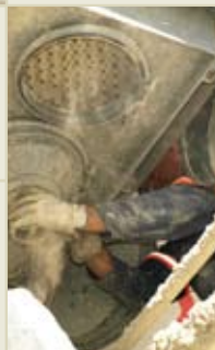
Replacement Service Parts