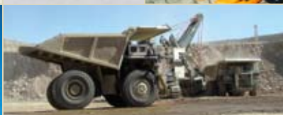
Mobile Dust Collection