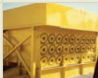
Compressed Air and Gas Filtration