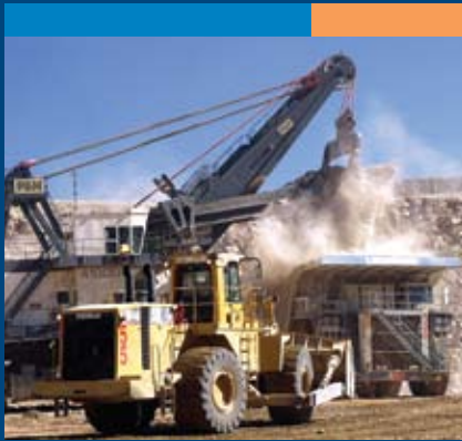
Donaldson provides rugged and reliable filtration solutions, designed to lighten the load above ground and below.

Our global organization consists of over 13,000 professionals who are dedicated to providing filtration products and systems that improve people's lives, enhance equipment performance and protect the environment.