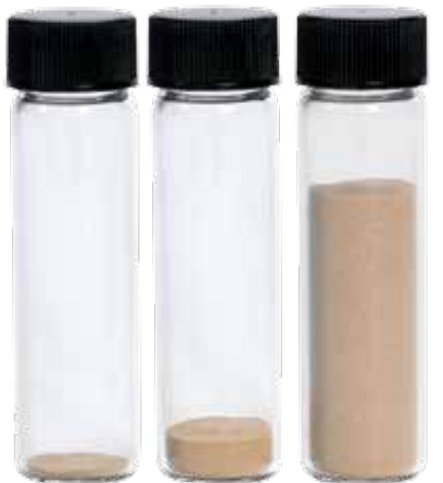
Donaldson Air Filter Media Ultra-Web® Standard Will-fit Air Filters Standard Media

99.99% 0.1 gram dust 99.9% 1 gram dust 99.0% 10 grams dust