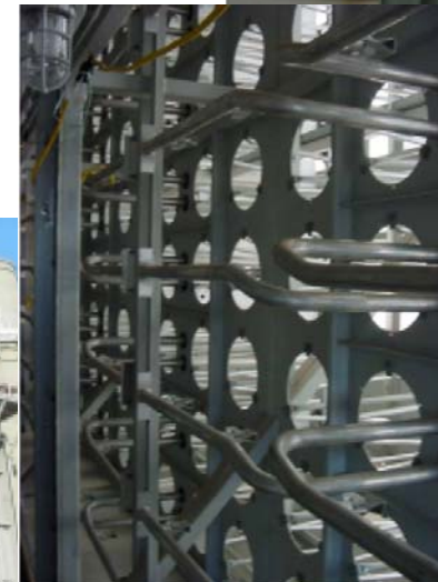
Pulse air tubing