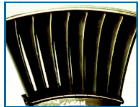
B) After 2360 operational hours, the blades behind the filters with Donaldson Spider-Web® are still clean -- and maintaining turbine output at optimal levels!

Donaldson filters with Spider-Web can also save you money on water washing...see example on other side.