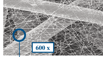
10 Micron Particulate, Ultra-Web ® SB Nanofibre Technology