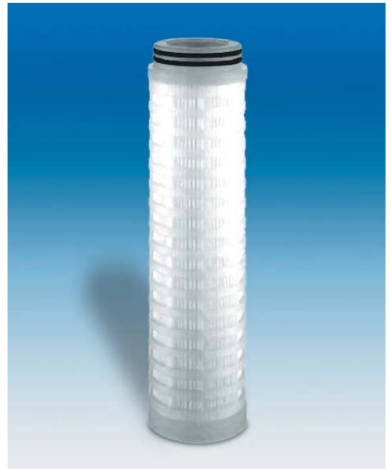
The Ultrapolyplea P-PP – the economical pre- and final filter for liquids and gases

Ultrapolyplea has passed the USP XX Class VI tests for plastics. The filter element is manufactured in accordance with the cGMP requirements (current Good Manufacturer Practice), has no migration of the filter medium, is non-fiber releasing, and thermally welded without use of binders or other additives. The filter element is pre-rinsed with 18 Mohm · cm water. Which leads to extremely low extractables.