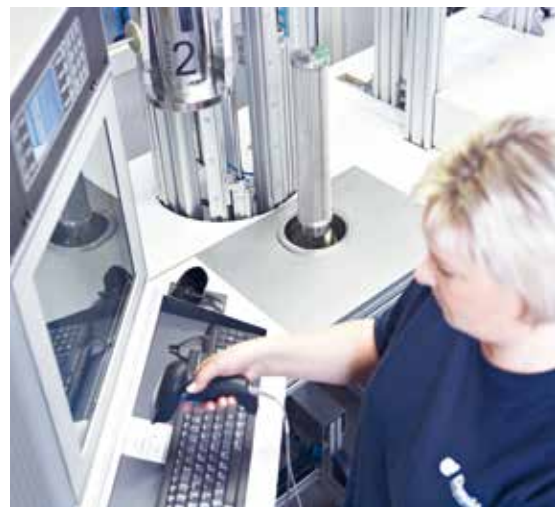
Donaldson offers a wide Range of Services

To enhance and complement our field services, highly sophisticated in-house laboratory services with highly sophisticated laboratory services are provided to validate oil aerosols, oil mist, particle size or concentrations.