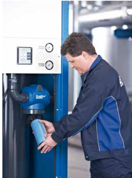
The Ultra-Filter Housing is easy to open in order to change the Filter Element

Donaldson provides services for all components of your compressed air system – the best selection of individual services or full service. Agreements comprising of different maintenance offerings tailored to fit your needs and requirements.