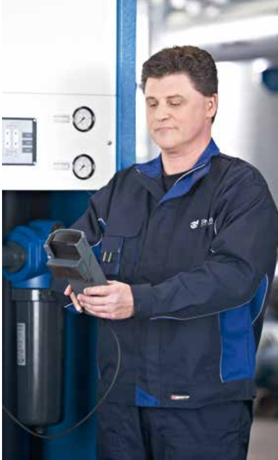
Total Filtration Service for Compressed Air