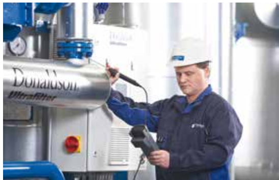
Preventative Maintenance avoids Emergency Calls

Donaldson's measurement technologies reliably determine your compressed air quality. Compressed air, dew point and residual oil are analysed. The air quality audit detects and precisely determines the oxygen, CO 2 and CO levels for special applications such as used for breathing air.