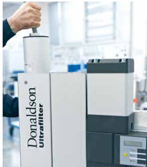
Clean and easy Exchange of the Cartridges