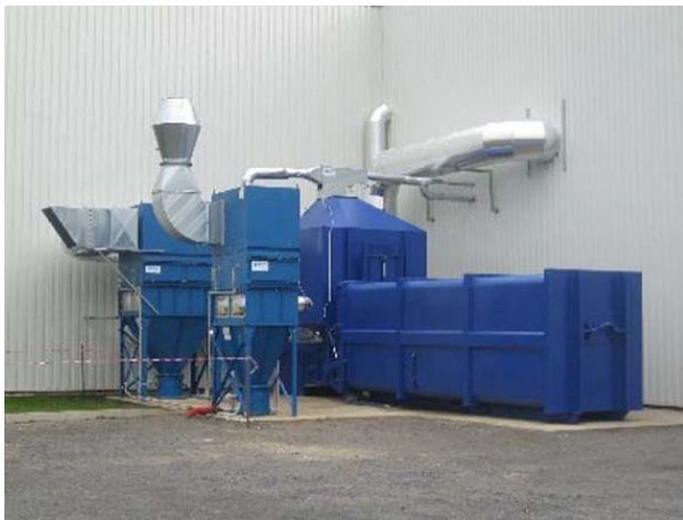
PowerCore® dust collectors at AFSI, Czech Republic

SOLUTION: PowerCore® Dust Collector with PowerCore® Filter Packs